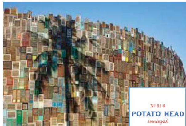
Potato Head Seminyak