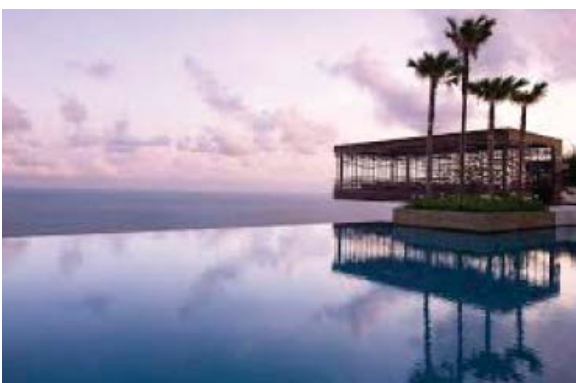
Alila Villas Uluwatu