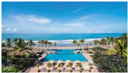
Legian Suites Bali