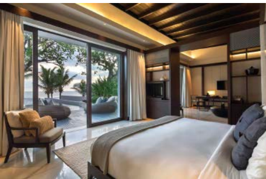
Soori Hotel Tabanan Bali